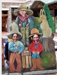
Having Fun at Keystone