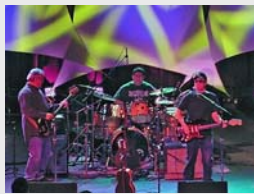
Los Lobos, January 15