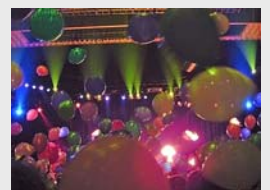
NYE Balloon Drop