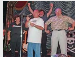
Last Show of the Cruise