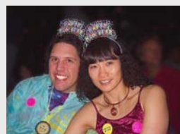
the Funfolks on NYE