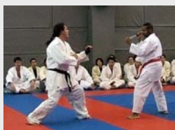
Showing Knife Defense