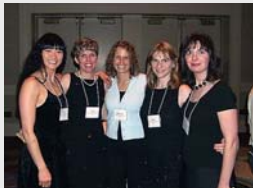
Girls at the Reunion