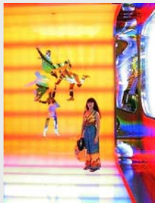
Ting in LOVE